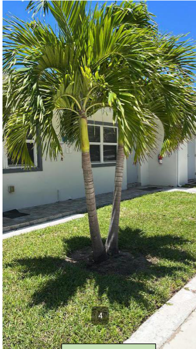
TREE #4, #8

Tim Hodgins –ISA Certified Arborist FL-6128A